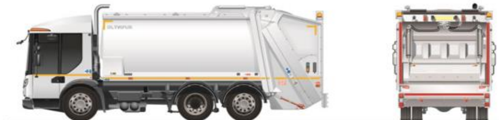
26 tonne Dennis Eagle Olympus (Residual Waste, Garden Waste)