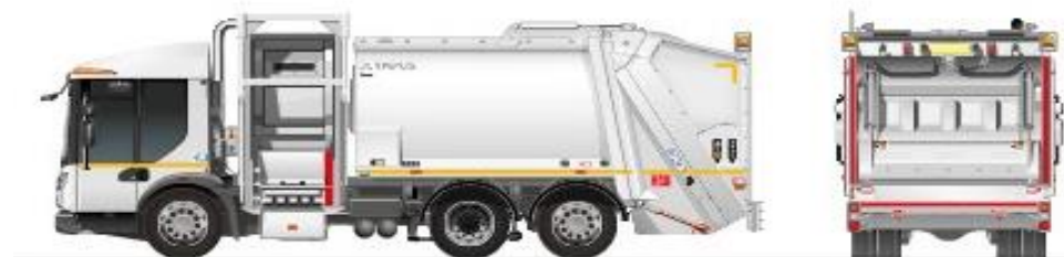
26 tonne Dennis Eagle Duo (Residual/Food - Flats)