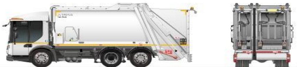
26 tonne Dennis Eagle Twin Pack (DMR/Food, Paper & Card/Food, DMR/Paper & Card - Flats)